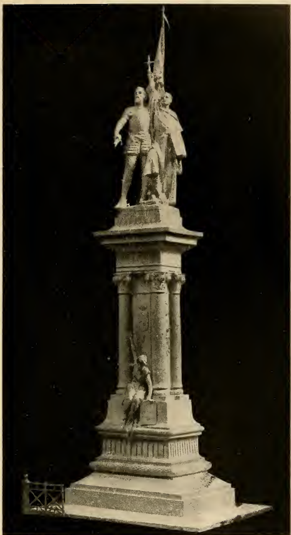
Monument in Manila to Legazpi and Urdaneta

[From a photograph in possession of the Colegio de Agustinos Filipinos, Valladolid]